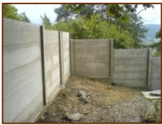
Hummene, Slovakia April 13, 2016

Fence built Year 2007 250 tombstones restored Year 2010 321 tombstones restored Year 2011